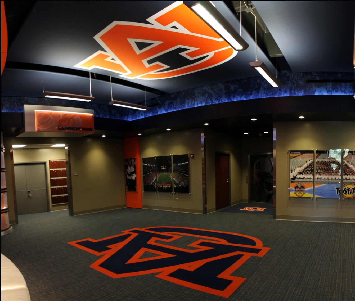
View looking back at the elevator that brings visitors into the space.