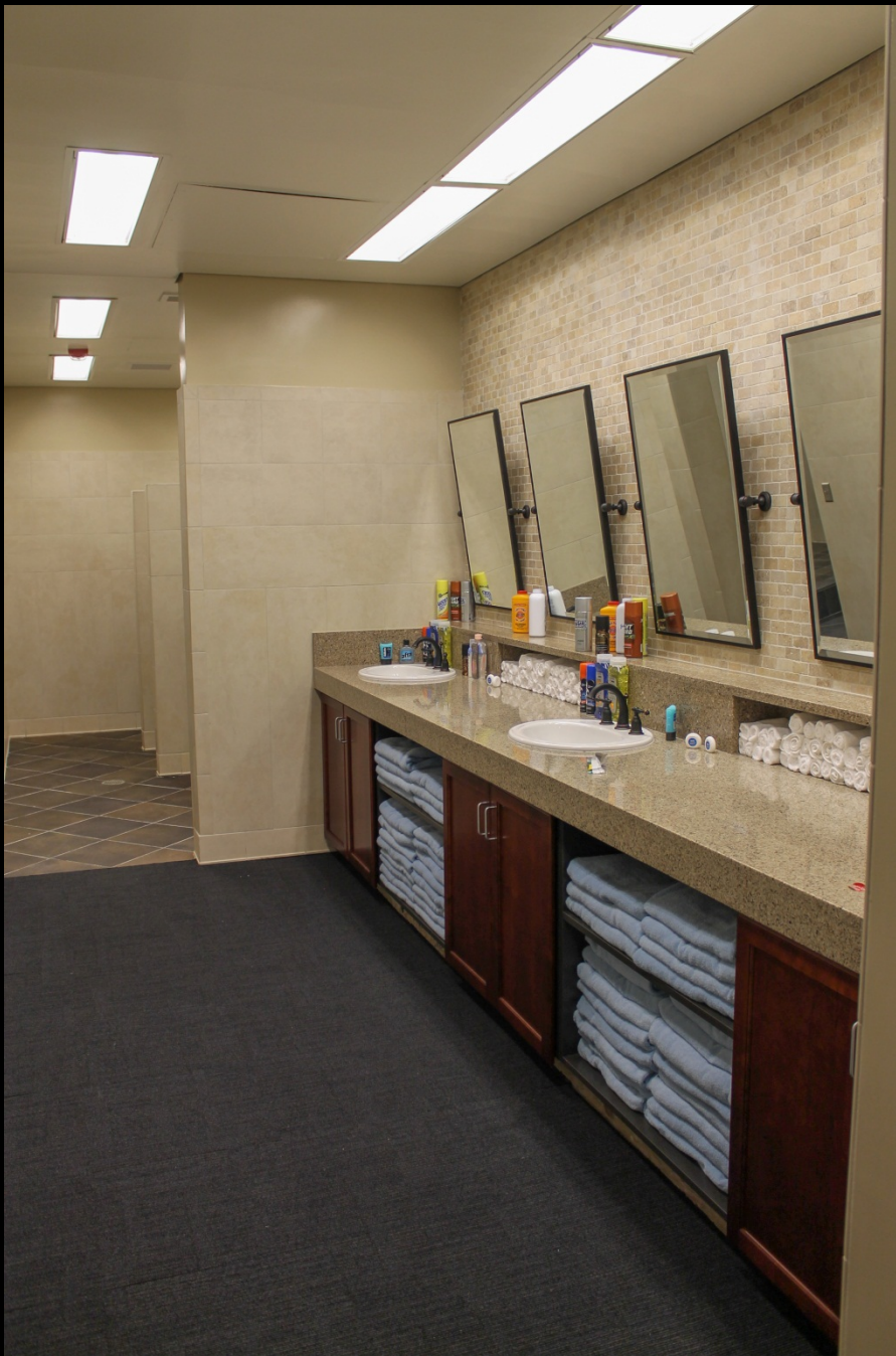
View of the new millwork, finishes and fixtures of the coaches' locker room sinks.