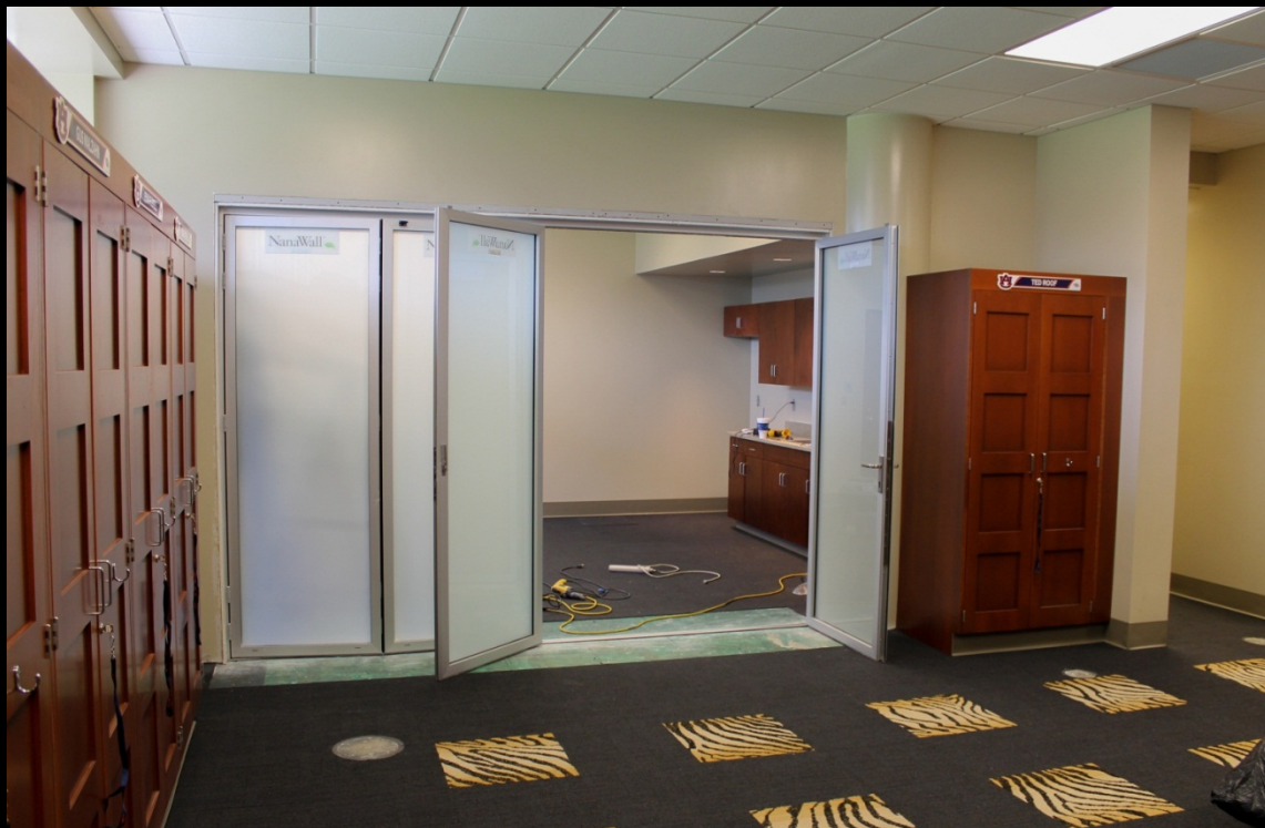
View of the new nanawall separation of the coaches' locker room and coaches' lounge during construction. Below is a rendering of this area.