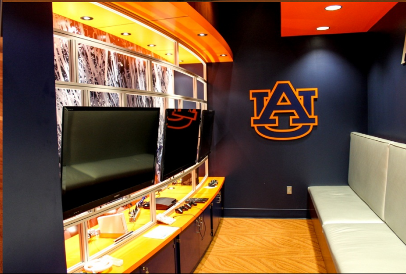
Clockwise from the top right: A view looking down the finished stairwell with custom railing at the ground level element; a view of the gaming area of the players lounge; a view of the custom space divider in the players lounge.