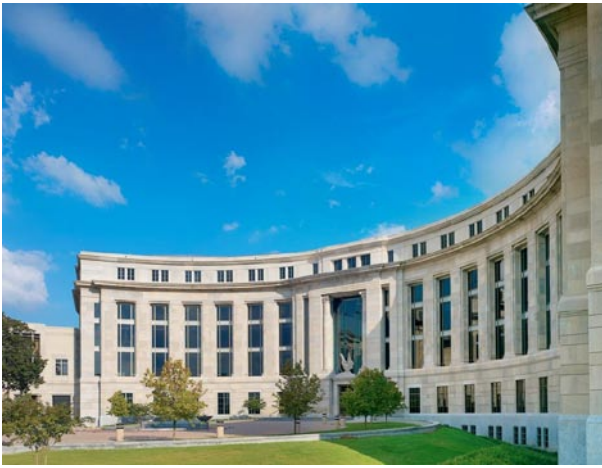
“United States Court House in Montgomery” Barganier Davis Sims Architects