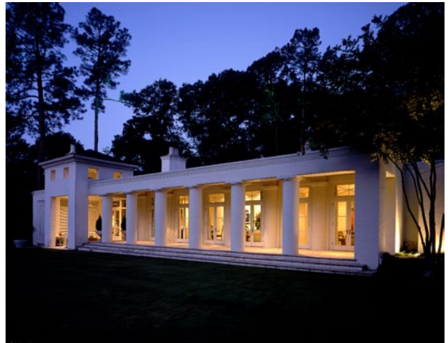
“The Barganier Residence” Barganier Davis Sims Architects