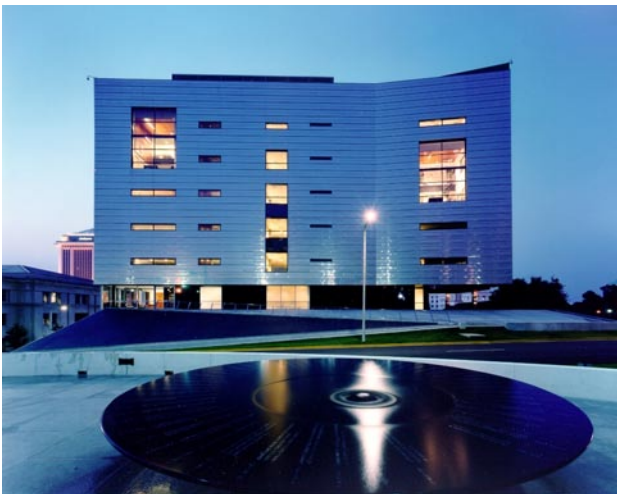
“Southern Poverty Law Center Office Building” Goodwyn Mills Cawood, L.L.C