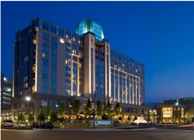
“Montgomery Renaissance Hotel and Conference Center” - Goodwyn Mills Cawood, L.L.C.