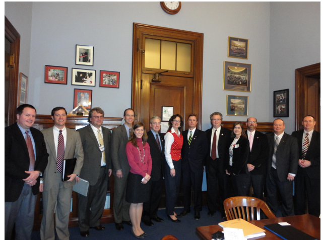
Photo from the AIA Grassroots 2011