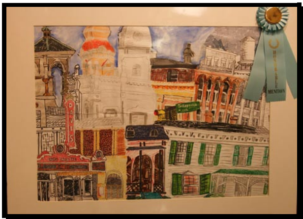
2009 Draw Montgomery Honorable Mention

I hope everyone is having a great summer and I will see you all in August.