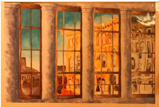
2008 Draw Montgomery Art Competition Entry